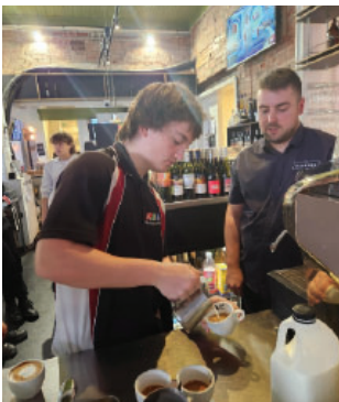
Barista Coffee Art