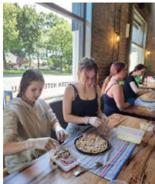
Putting your spin on a Pizza