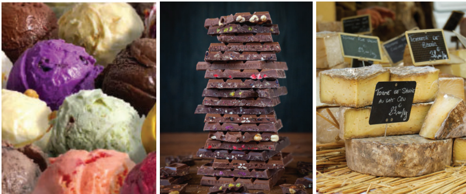
A range of treats you will learn about and be able to taste on the day.

Visit The Mill in Castlemaine, and spend 30 mins with each of the following businesses; Ice Cream Republic, Cabosse & Feve Chocolates and Long Paddock Cheese. Each business will provide a talk about their business and the production of their products. Then each student will get to sample some of the products, rotating between the businesses.