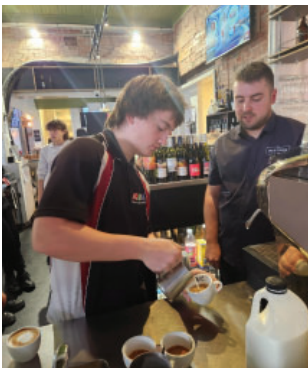
Barista Coffee Art