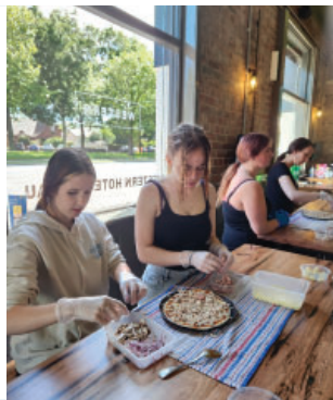
Putting your spin on a Pizza