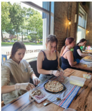
Putting your spin on a Pizza