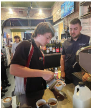
Barista Coffee Art